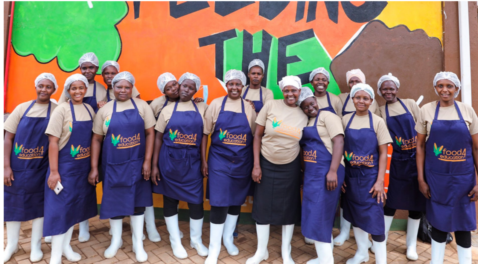
Our wonderful team at our Ruiru kitchen prepares meals for 18,000 children!