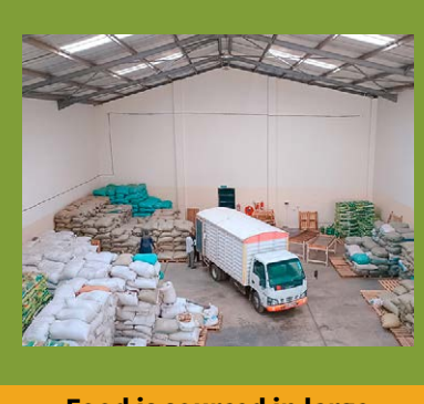
Food is sourced in large volumes from large aggregators to secure best