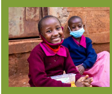
Children receive a hot. nutritious meal and can focus, participate and perform in the