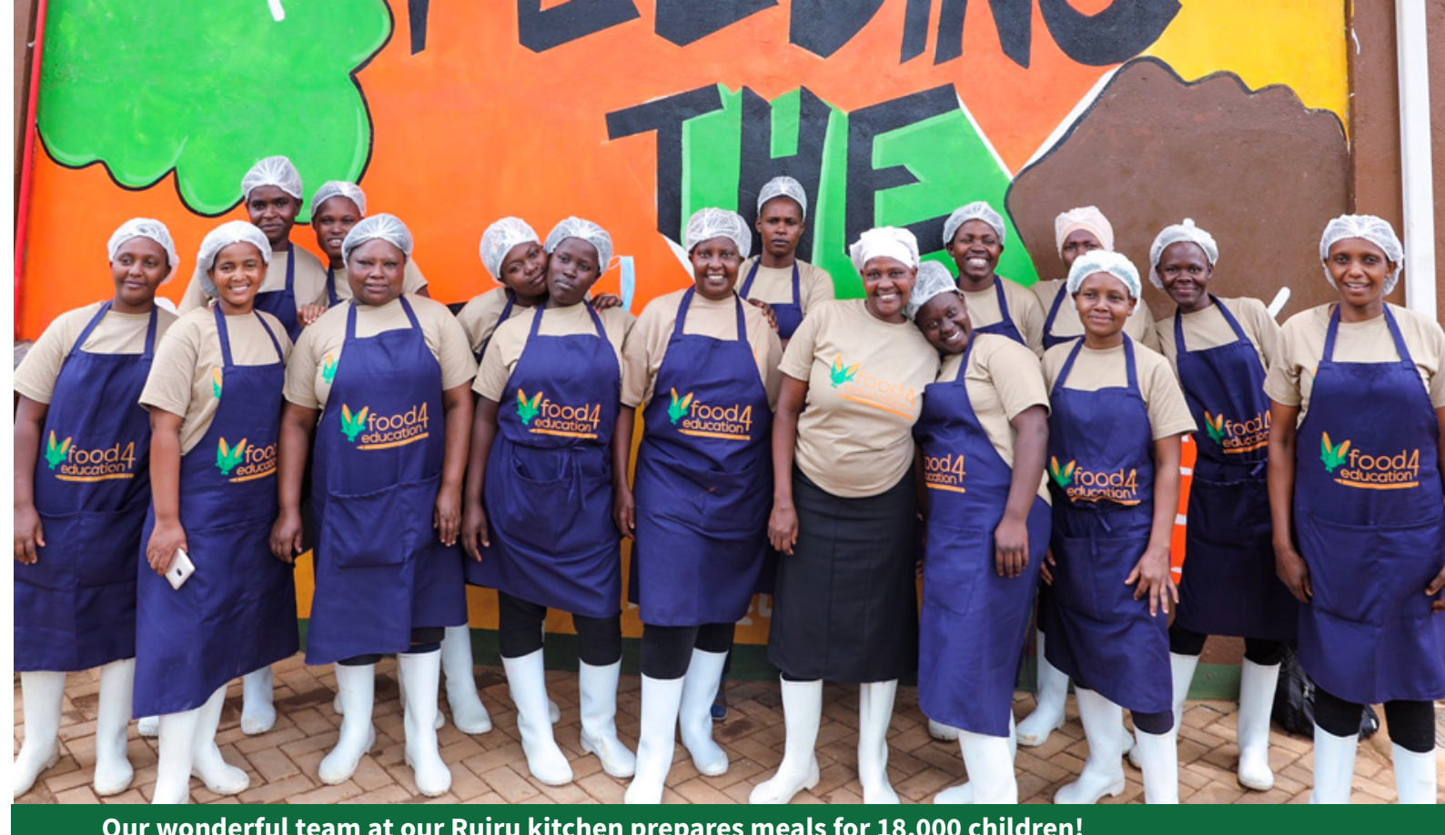
Our wonderful team at our Ruiru kitchen prepares meals for 18,000 children!