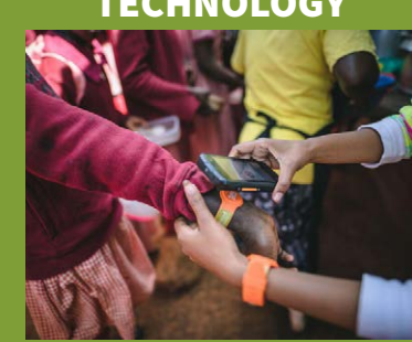
Children use their NFC watch to tap to eat, $0.15 is deducted from their virtual wallet and a digital record is kept